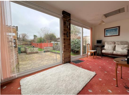
Bedroom One:- 12' 1" Into Part Bay x 10' 7" (3.68m x 3.22m) Maximum Measurements

UPVC double glazed part bay window to front elevation and radiator.