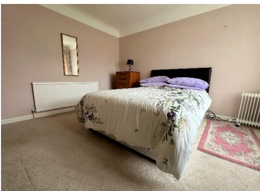
Bedroom Three:- 8' 1" x 7' 5" (2.46m x 2.26m)

UPVC double glazed window to front elevation and radiator.