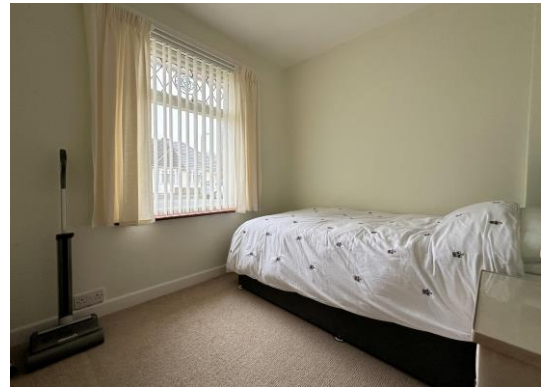
Shower Room:- 6' 0" x 4' 11" (1.83m x 1.50m) Maximum Measurements

UPVC double glazed part bay window to front elevation and radiator.